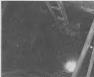
Investigators believe this narrow passageway was used by escaped slaves as part of the Underground Railroad

The secret entrance to the tunnel was found behind a bookcase in a basement office of the Meachum Building. The tunnel travels about 15 feet underground and connects to a drainage pipe emptying into the Dale River. Not only do police believe the discovery can help an unsolved case, historians believe it may also rewrite American History.