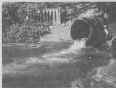
The hidden tunnel connects to a stormwater pipe draining into the Dale River near the Pedestrian Bridge

The secret entrance to the tunnel is located in the same building where Dean Cahill was murdered on October 26th, 1995. The newly appointed 29-year old dean was alone in the